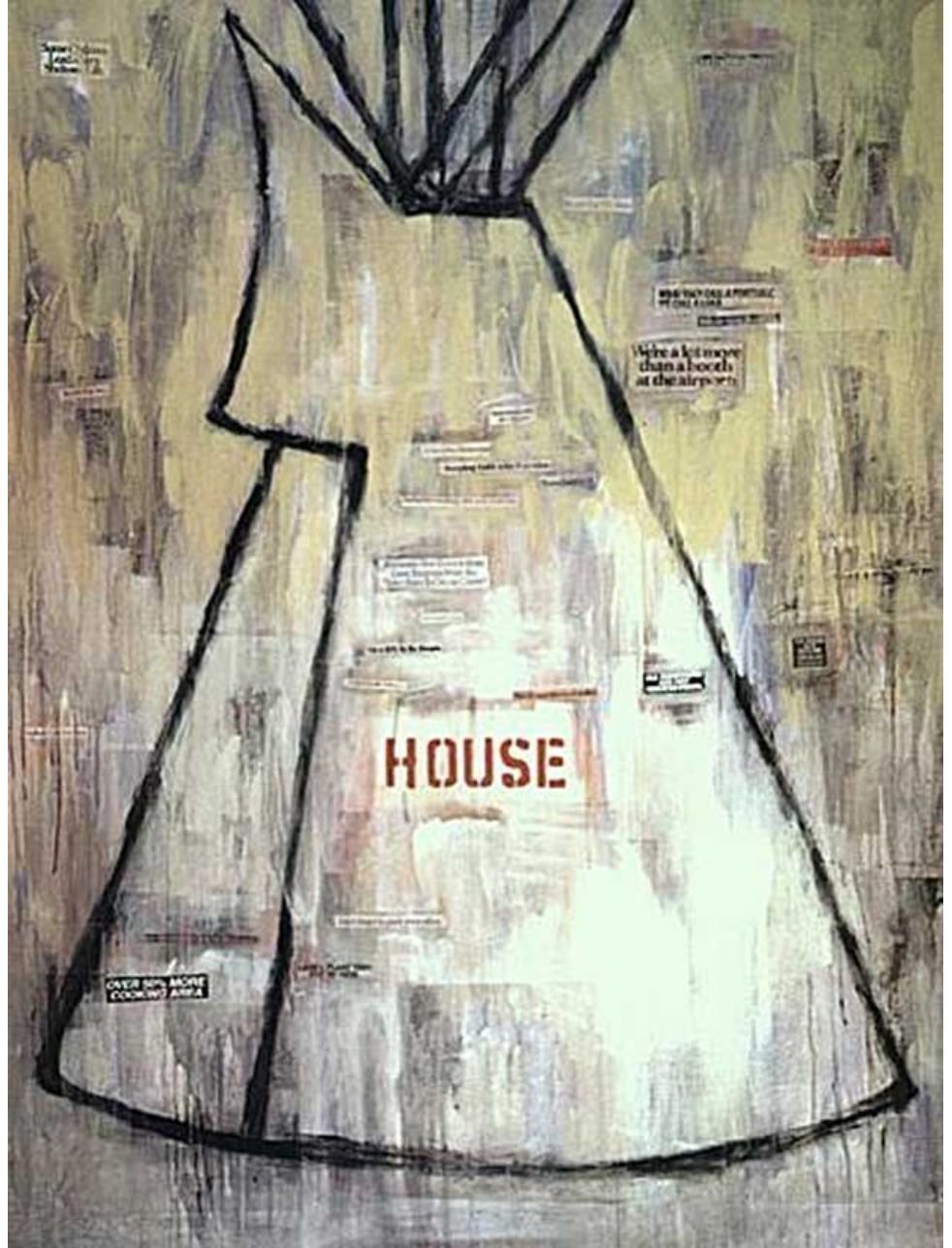
House and Home

Her work is in collections at the Whitney Museum, the Metropolitan Museum, the Brooklyn Museum, Smithsonian American Art Museum, the Walker, the Victoria and Albert Museum, London and the Museum of Modern Art, New York;