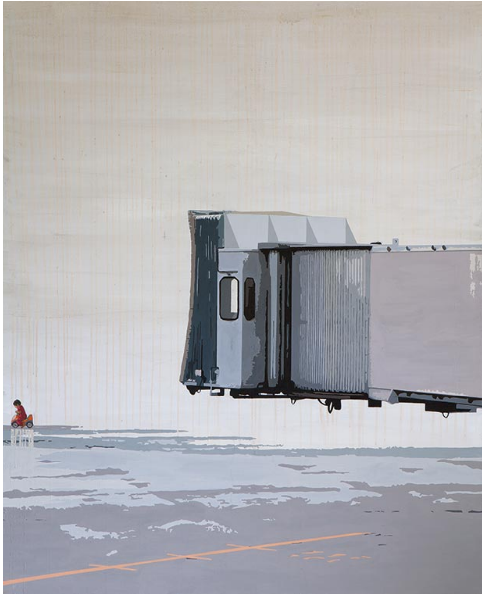
Flying Lesson #4 © Hani Zurob / Courtesy of the Artist