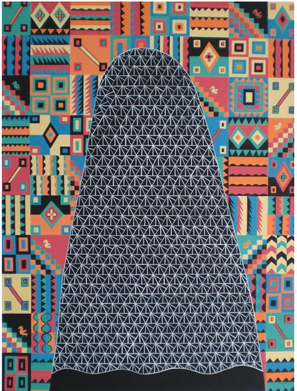
Woven in Exile © Helen Zughuib / Courtesy of the Artist